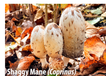
Shaggy Mane ( Coprinus )

FIELD CAPS – Not all mushrooms grow in the Fall, as shown by this Spring mushroom. There are only a few species in this group, and they can be found worldwide. They are partly distinguished by their smooth cap cracking with age. Look for them in gardens, lawns, and wood chips. Agro-cybe means field-cap.