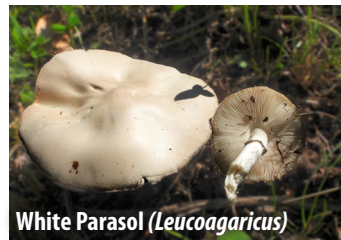
White Parasol ( Leucoagaricus )

SHAGGY PARASOL GROUP – These common, handsome mushrooms can be easy to recognize. All have at least one ring on the stem, and one species has a double-edged ring. All have brownish scales on the cap (up to 15cm wide), and light spores. They can be found in forests and grassy areas and on roadsides.