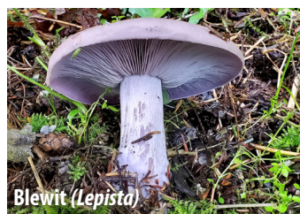
Blewit ( Lepista )

OTHER LIGHT-SPORED MUSHROOMS – These 2 species once belonged to the Clitocybe genus, but that group is now in flux as DNA analysis moves some species into different genera. This is happening in other groups as well, as scientists analyze mushrooms at the genetic level.