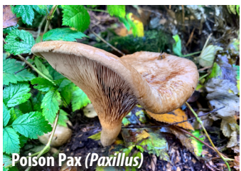
Poison Pax ( Paxillus )

PHOLIOTA – This large and fairly common genus has brown-spored, forest-dwelling mushrooms that are often found clustered on dead or dying trees. Their cap colours range from yellow to rusty brown and the caps are often sticky and scaly. The beautiful clusters can be exciting for photographers to find!