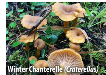
Winter Chanterelle ( Craterellus )

SULPHUR TUFT – This common decomposer mushroom often grows on fallen trees in large tight clumps (or tufts) and can be found from spring to late fall. As the name suggests, the caps can be bright yellow or greenish-yellow. They are generally considered poisonous.