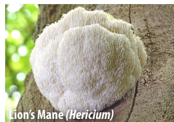
Lion's Mane ( Hericium )

TOOTHED – Mushrooms in this group all have teeth on their spore-bearing surface – but that doesn't mean they're closely related. Some can be difficult to identify, but there are a few easy ones that some consider good edibles. Several can be used to make dyes, and others for medical research.