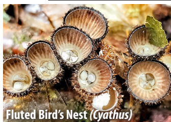
Fluted Bird's Nest ( Cyathus )

PUFFBALLS & SIMILAR – This group also includes Earthstars and Dead Man's Foot . All have spores housed in a capsule that grows thin and breaks, releasing the spores. Spores are also released when the mushroom is stepped on or hit by raindrops. The inset photos show where the capsule has opened.