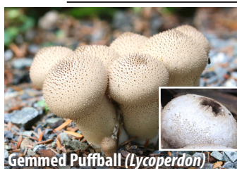
Gemma Puffball ( Lycoperdon )