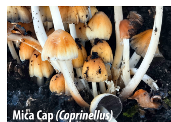
Miça Cap ( Coprinellus )