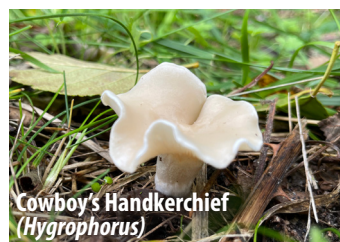
Cowboy's Handkerchief ( Hygrophorus )

WAXY CAPS – These members of a light-spored group are lumped together because their gills are shiny and feel greasy, like soft wax. They're usually found in the woods, as they are associated with certain trees. This is a large group, with over 100 species found in BC.