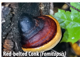
Red-belted Conk ( Fomitopsis )

POLYPORE – Some common species in this woody group are the Sulphur Shelf (Chicken of the Woods) , the colourful Turkey Tail , with its rows of fans, and the Red-belted Conk , a perennial that grows a new pore layer every year. Polypores can be found on living and dead trees, sometimes killing their host.