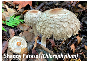
Shaggy Parasol ( Chlorophyllum )

WAXY CAPS – These members of a light-spored group are lumped together because their gills are shiny and feel greasy, like soft wax. They're usually found in the woods, as they are associated with certain trees. This is a large group, with over 100 species found in BC.