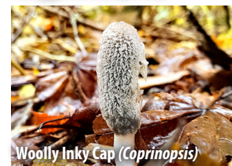
Woolly Inky Cap ( Coprinopsis )

INKY CAPS – These dark-spored species belong to related genera that are distinguished by their flesh turning to black goo as they age, in an effort to spread their spores. Common in our area, some grow in large groups on wood and others on roadsides. Shaggy Manes are a good edible when young and when found in unpolluted areas.