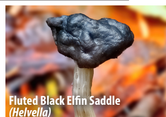
Fluted Black Elfin Saddle ( Helvella )

MORELS & SIMILAR – The caps of the mushrooms in this group can be ridged, pitted, saddle-shaped, lobed, or irregular. Some of the prized edible Morel species can be found after forest fires and should be cooked well before eating. The False Morel (Gyromitra) looks more like brains on a stem and is poisonous.