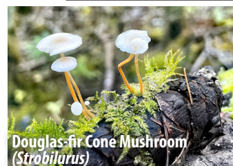
Douglas-fir Cone Mushroom ( Strobilurus )

The mycelium of one Honey Mushroom species in Oregon was found to cover over 900 hectares, making it one of the largest living organisms in the world.