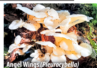
Angel Wings ( Pleurocybella )

OYSTER & LOOK-ALIKES – The stems of the mushrooms in this light-spored group can be absent or off-centre. This includes the Oyster and Angel Wings , both of which are found growing on wood in a shelf-like fashion. Mushrooms in this group are wood-decayers, and some may also snare and eat tiny worms.