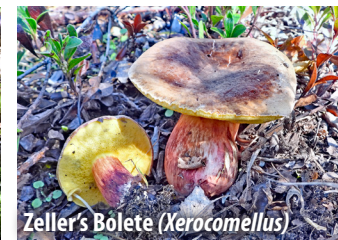
Zeller's Bolete ( Xerocomellus )