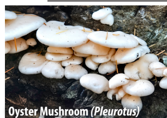
Oyster Mushroom ( Pleurotus )

SMALL DECOMPOSERS – These small, light-spored mushrooms are often called LBMs (little brown mushrooms). The first is found only on Douglas-fir cones. The Fairy Ring is common in fields or lawns and can form rings where it grows. Some in the Mycena genus are brightly coloured and decompose the stumps they grow on.