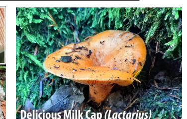
Delicious Milk Cap ( Lactarius )

MILK CAPS – Although in some ways similar to Russula spp. , this genus is distinguished by liquid (see inset) that oozes out if the flesh of the cap or gills is damaged. In some species it looks like milk, although it may be other colours. Some in this genus are considered good edibles. All are associated with trees (mycorrhizal).