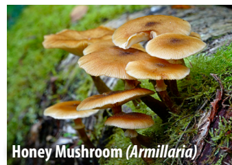
Honey Mushroom ( Armillaria )

OTHER LIGHT-SPORED MUSHROOMS – These 2 species once belonged to the Clitocybe genus, but that group is now in flux as DNA analysis moves some species into different genera. This is happening in other groups as well, as scientists analyze mushrooms at the genetic level.