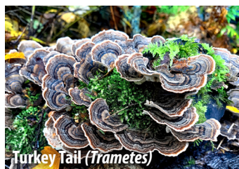
Turkey Tail ( Trametes )