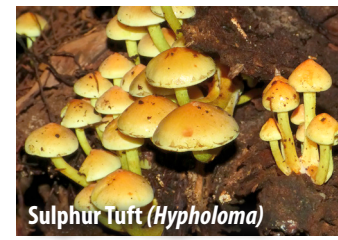
Sulphur Tuft ( Hypholoma )

INKY CAPS – These dark-spored species belong to related genera that are distinguished by their flesh turning to black goo as they age, in an effort to spread their spores. Common in our area, some grow in large groups on wood and others on roadsides. Shaggy Manes are a good edible when young and when found in unpolluted areas.