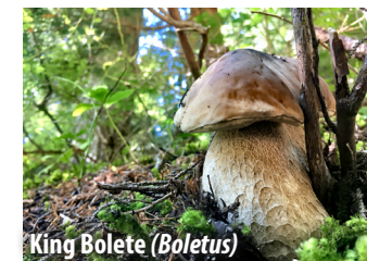
King Bolete ( Boletus )

PORED (BOLETES) – Instead of gills, these mushrooms have a fleshy pore surface, like a sponge, from which spores are released. Some of the most prized edibles can be found in this group.