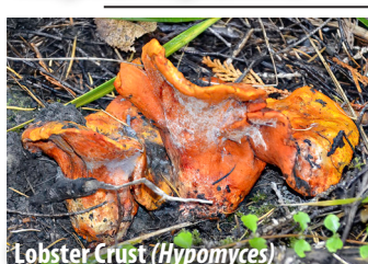
Lobster Crust ( Hypomyces )

CUPS – Species in this group have cup-shaped fruiting bodies that release their spores up and into the wind. Some may expel a cloud of spores just by being warmed in your hand. The carotene-containing Orange Peel Fungus is aptly named, and is common in urban areas, in hard-packed soil.