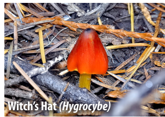
Witch's Hat ( Hygrocybe )