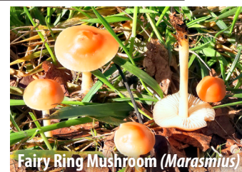
Fairy Ring Mushroom ( Marasmius )