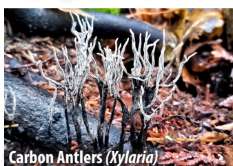
Carbon Antlers ( Xylaria )

CLUBS & CORALS – Members of these groups typically have erect, simple, or branched fruiting bodies (mushrooms). Some are named for their similarity to marine coral. They can be solitary or in groups, on the ground, on decaying vegetation, or on dead wood. It can be difficult to determine the exact species in this group.