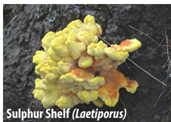
Sulphur Shelf ( Laetiporus )

POLYPORE – If it's tough, corky, or leathery and growing out of decaying wood, it's probably a polypore. They often have fine pores on the underside, but, unlike those on Boletes, these pores cannot be easily separated from the cap. Some are used for medicinal purposes, but generally they are too tough to attempt eating.