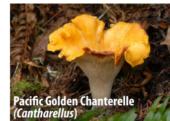
Pacific Golden Chanterelle ( Cantharellus )

VEINED – Although included here with the Gilled mushrooms, species in this group have veins or forking wrinkles, which can run down the stem. This group includes the two edible Chanterelle species featured here — exciting finds for mushroom pickers the world over — as well as several inedible species.