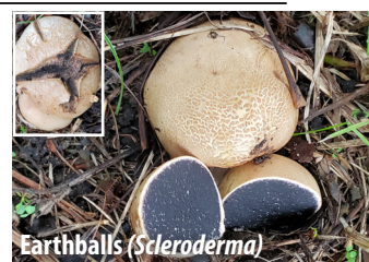
Earthballs ( Scleroderma )

PUFFBALLS & SIMILAR – This group also includes Earthstars and Dead Man's Foot . All have spores housed in a capsule that grows thin and breaks, releasing the spores. Spores are also released when the mushroom is stepped on or hit by raindrops. The inset photos show where the capsule has opened.