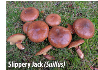
Slippery Jack ( Suillus )

BOLETES & SIMILAR – A few different groups of pored mushrooms are included here: the edible and choice King Bolete ; the lovely, often velvety Zeller's Bolete , and the Slippery Jack , a slightly different variety of Bolete. Many are associated with specific tree species.