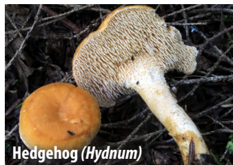
Hedgehog ( Hydnum )

TOOTHED – What's unique about these mushrooms is that they produce spores on their icicle-like spines instead of on veins, wrinkles, pores, or gills.