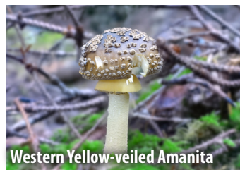
Western Yellow-veiled Amanita