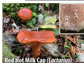
Red Hot Milk Cap ( Lactarius )

RUSSULAS – Common in forests, this genus of light-spored mushrooms contains many colourful species. The stems of Russula spp. are usually shorter than the cap is wide and have no ring. Key features are their brittle flesh and a stem that snaps like chalk. Lab analysis may be required for accurate species identification.