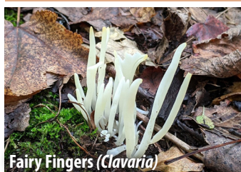
Fairy Fingers ( Clavaria )

OTHER NEAT 'SHROOMS – This section includes a fascinating variety of mushrooms that have evolved unique mechanisms and shapes to try to spread their spores more widely.