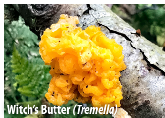
Witch's Butter ( Tremella )

CLUBS & CORALS – Members of these groups typically have erect, simple, or branched fruiting bodies (mushrooms). Some are named for their similarity to marine coral. They can be solitary or in groups, on the ground, on decaying vegetation, or on dead wood. It can be difficult to determine the exact species in this group.