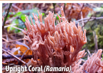
Upright Coral ( Ramaria )