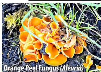
Orange Peel Fungus ( Aleuria )

MORELS & SIMILAR – The caps of the mushrooms in this group can be ridged, pitted, saddle-shaped, lobed, or irregular. Some of the prized edible Morel species can be found after forest fires and should be cooked well before eating. The False Morel (Gyromitra) looks more like brains on a stem and is poisonous.