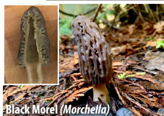
Black Morel ( Morchella )

BIRD'S NEST FUNGI – Tiny (<2cm wide) and aptly named, members of this group have small cups containing spore cases (peridioles) that look like eggs. Rain hits the spore cases and propels them up to 2m out of the cup to release their spores. Each case can hold up to 50 million spores!