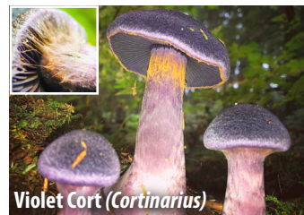
Violet Cort ( Cortinarius )

AGARICUS – This chocolate-brown-spored genus tends to be large (caps up to 30cm wide) and fleshy. An important feature is the presence of a ring on the stem. The store-bought Button , Cremini , and Portobello mushrooms are in this group, but other Agaricus spp. can cause stomach upset. Some, like the Flat-top Agaricus , smell like tar, and The Prince smells like almonds.